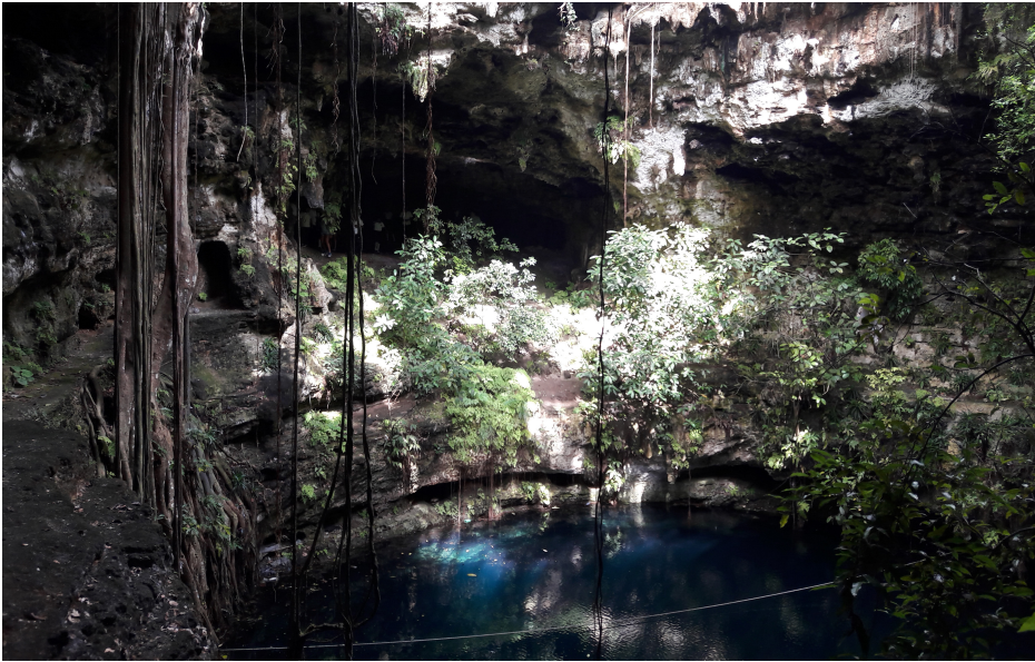
View from inside a cave within the cenote at Tixhualactún, Yucatán.

pating in the Cultural Heritage, Ecology, and Conservation of Yucatec Cenotes project sponsored by National Geographic. During our month abroad, we also were able to visit local museums, markets, restaurants, and become more immersed in the culture of Yucatán.