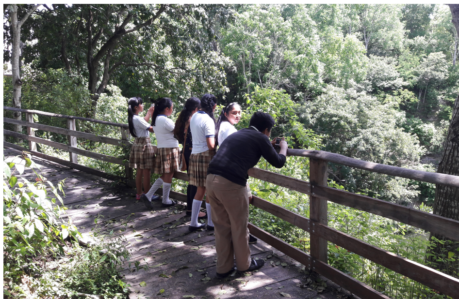
Students from Secundaria Humberto Cantón Moller in Kaua participate in a photovoice activity at their local cenote called Yax Ek', or Green Star.