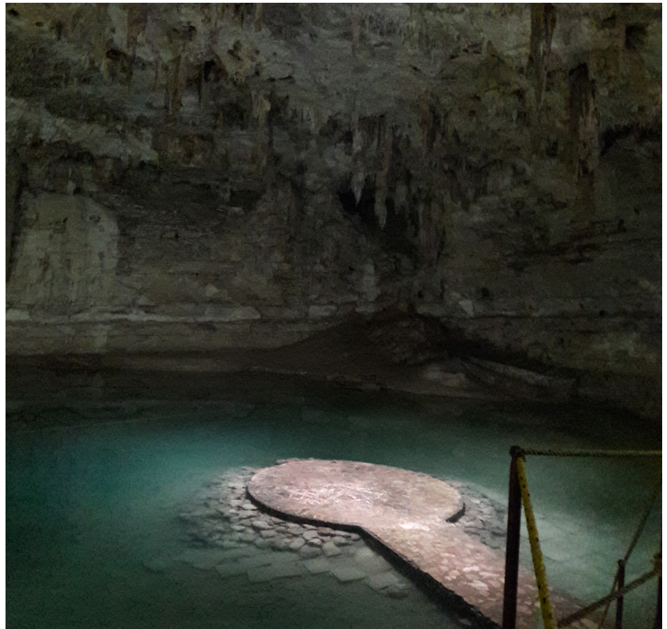
Cenote Suytun in Yucatán, Mexico.

Trailing their teachers, two boys carried a heavy black pelican case